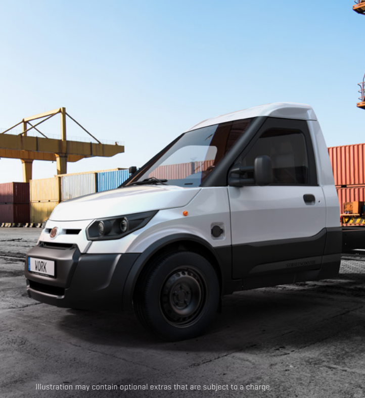
Illustration may contain optional extras that are subject to a charge.