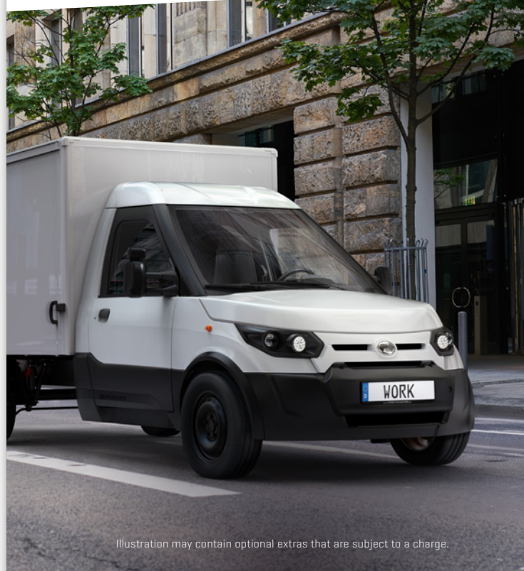
Illustration may contain optional extras that are subject to a charge.

*StreetScooter WORK basic model with optional box body package ex works