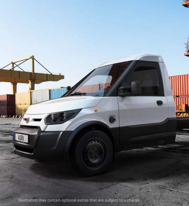
Illustration may contain optional extras that are subject to a charge.