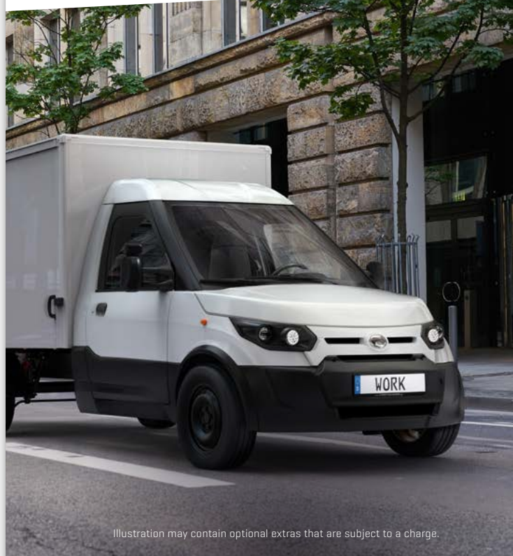
Illustration may contain optional extras that are subject to a charge.

*StreetScooter WORK basic model with optional box body package ex works